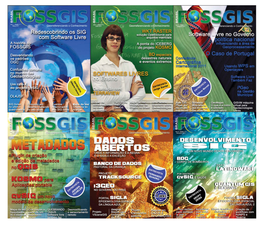
Figure 1. Issues of FOSSGIS Brasil published in 2011–2012.

example, one issue included a conversation with Gilberto Câmara, then president of INPE, about the development of the SPRING GIS (Medeiros 2011). A map gallery section in the magazine allowed GIS analysts and cartographers working in Brazilian industries and governments to showcase their work. Contributors to the gallery included geographers, teachers, and government planning officials at the state and municipal levels.